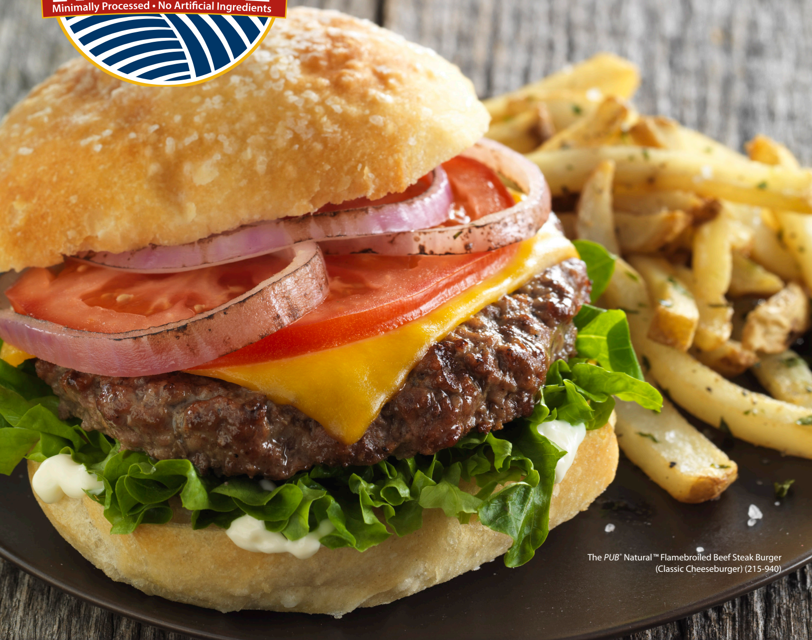
The PUB ® Natural ™ Flamebroiled Beef Steak Burger (Classic Cheeseburger) (215-940)

Raised without hormones and no antibiotics - ever.