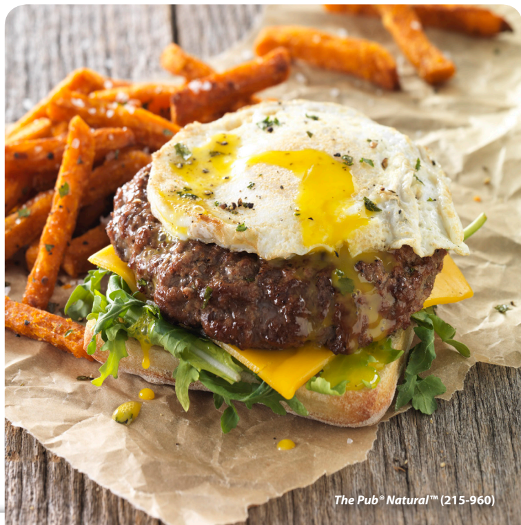
The Pub® Natural™ (215-960)

DID YOU KNOW? | 38% of consumers would pay more for beef that is raised without hormones, and 35% of consumers would pay more for beef that is raised without antibiotics - ever.