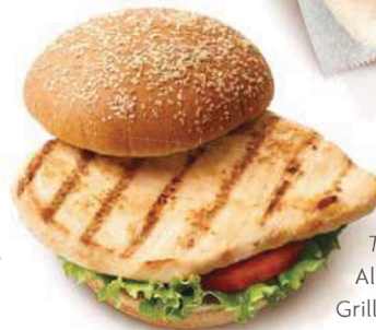
Tyson® Red Label™ All Natural* Backyard Grilled Filet