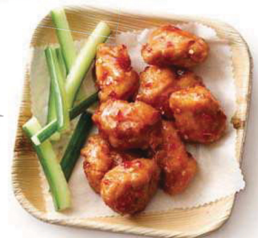
Tyson® Red Label™ All Natural* Crumb Coated Boneless Wings