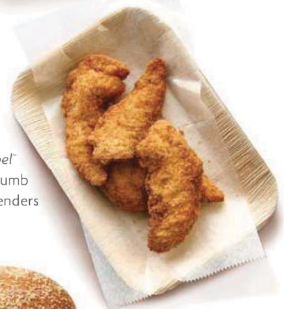
Tyson® Red Label™ All Natural* Crumb Coated Tenders