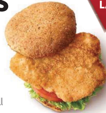
Tyson® Red Label™ All Natural* Crumb Coated Filet

Our new additions to the Tyson® Red Label™ product line are the result of insights-driven culinary innovation. Our original Red Label™ product research told us the most popular flavors, forms and sizes, but we couldn't stop there. We asked, and operators and consumers both told us that they also want all natural options that contain no preservatives, no artificial ingredients and are minimally processed. "All natural" ranked highest above all other options as the most preferred "better-for-you" attribute, *** and many national chains are already moving in this direction.